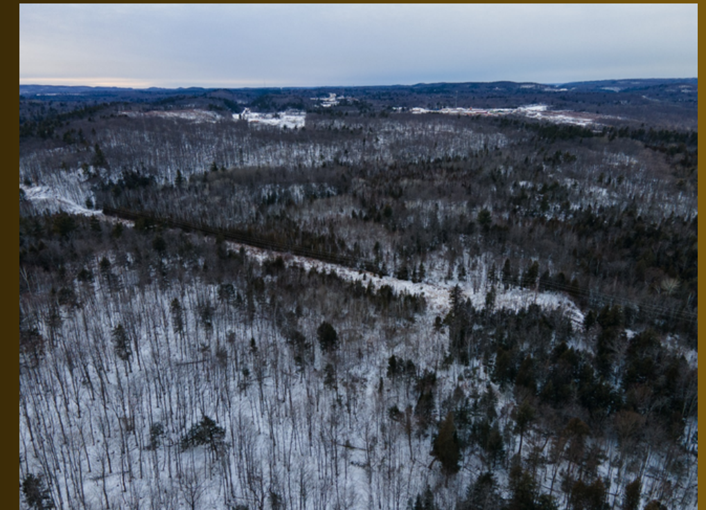
Acquisition 176 acres