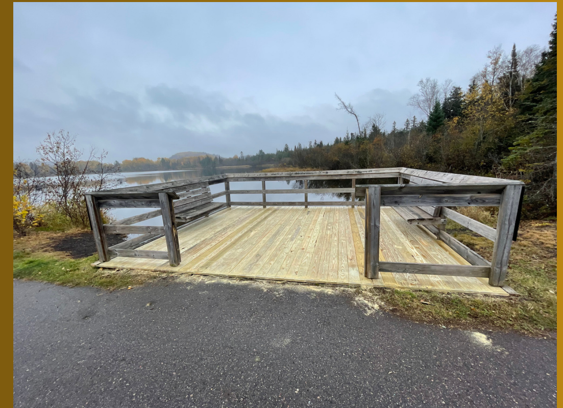
Redecked Section 16 Fishing Dock and fixed split rail fence in Ishpeming