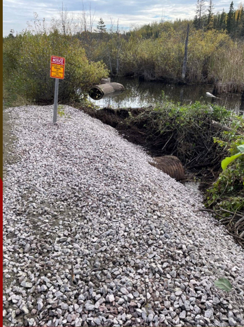
Culvert and trail repair, Tilden