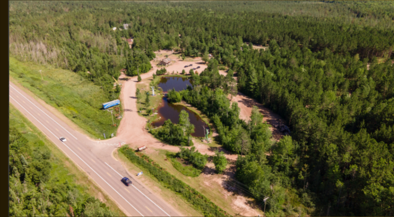
Lakenenland 5-mile Extension