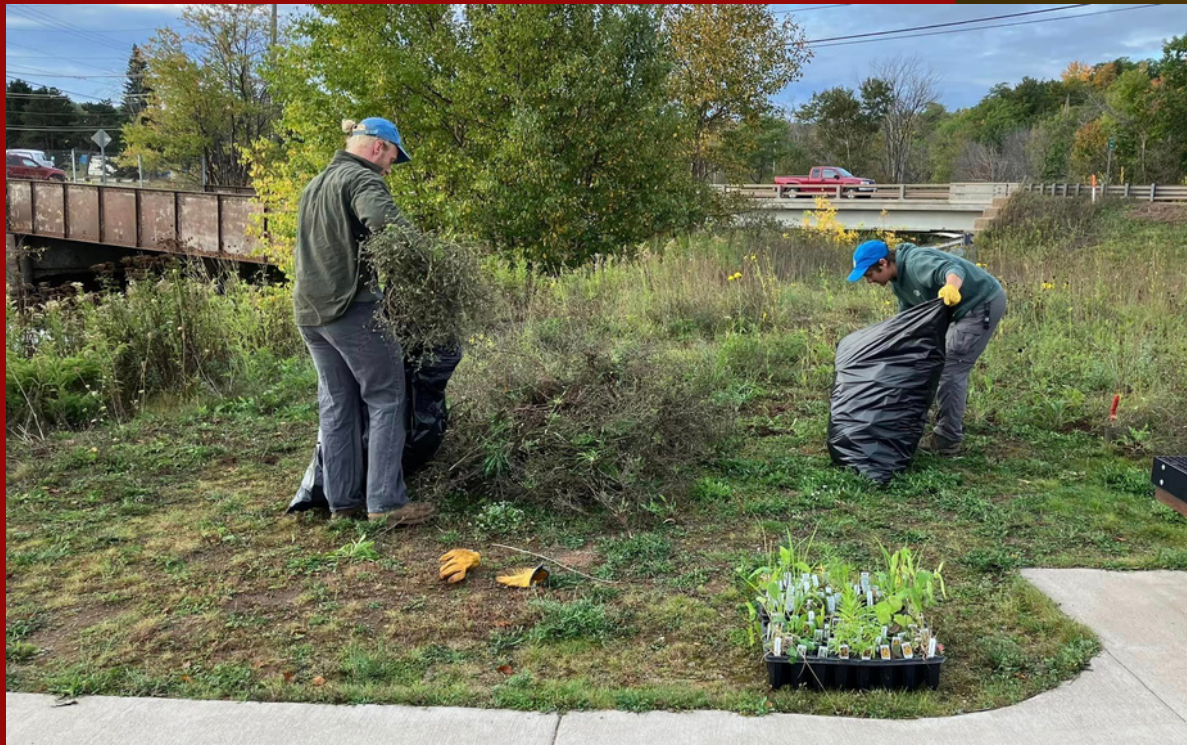
Carp River Kiln weed removal and new native plantings after new maintenance agreement signed