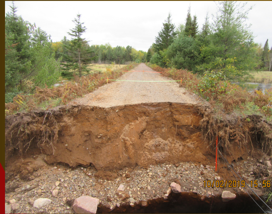
Fixed major culvert washout along with bridge replacement in Humboldt Township repaired with ORV funding