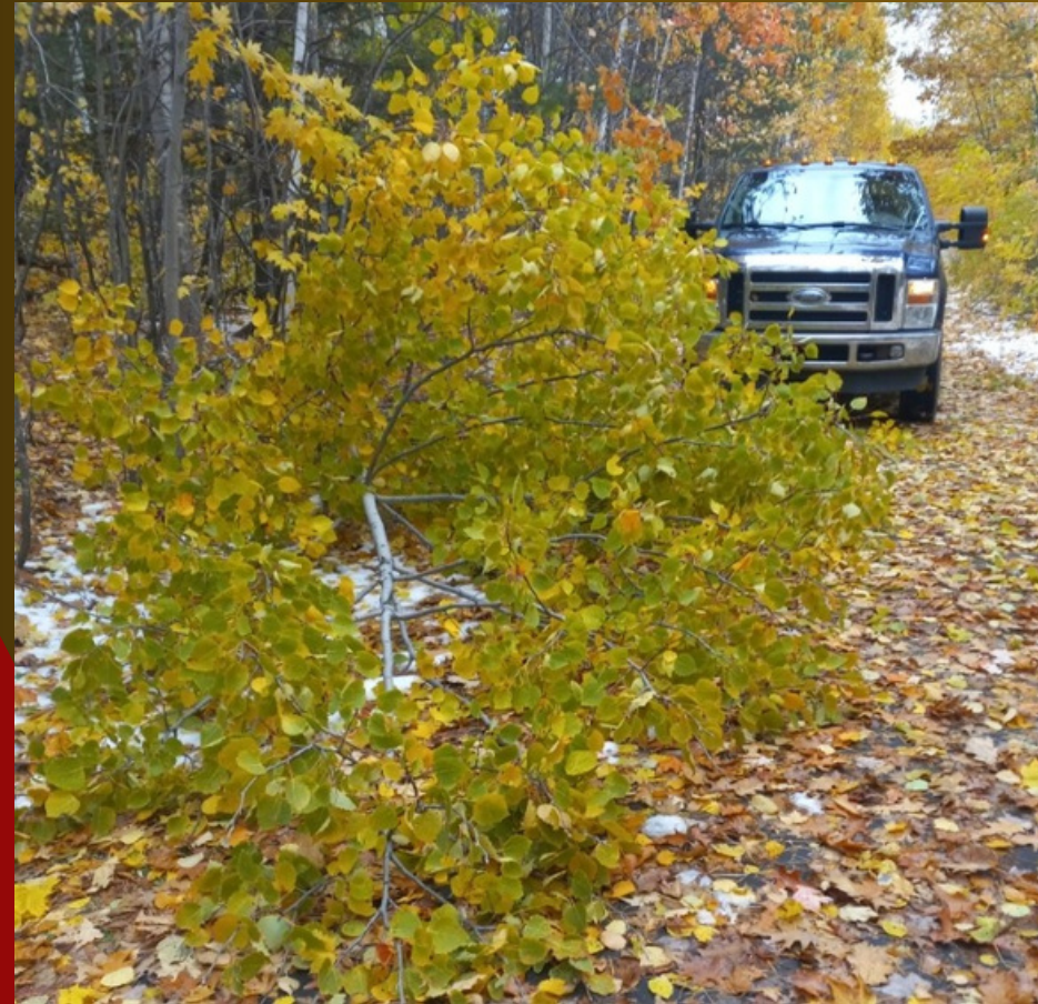
Tree clearing after major spring storms & major brushing effort between Ishpeming and Negaunee. Carp River clean up of large logs at bridge site, Negaunee