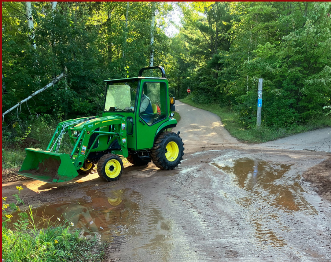
Using new tractor to fix low spot