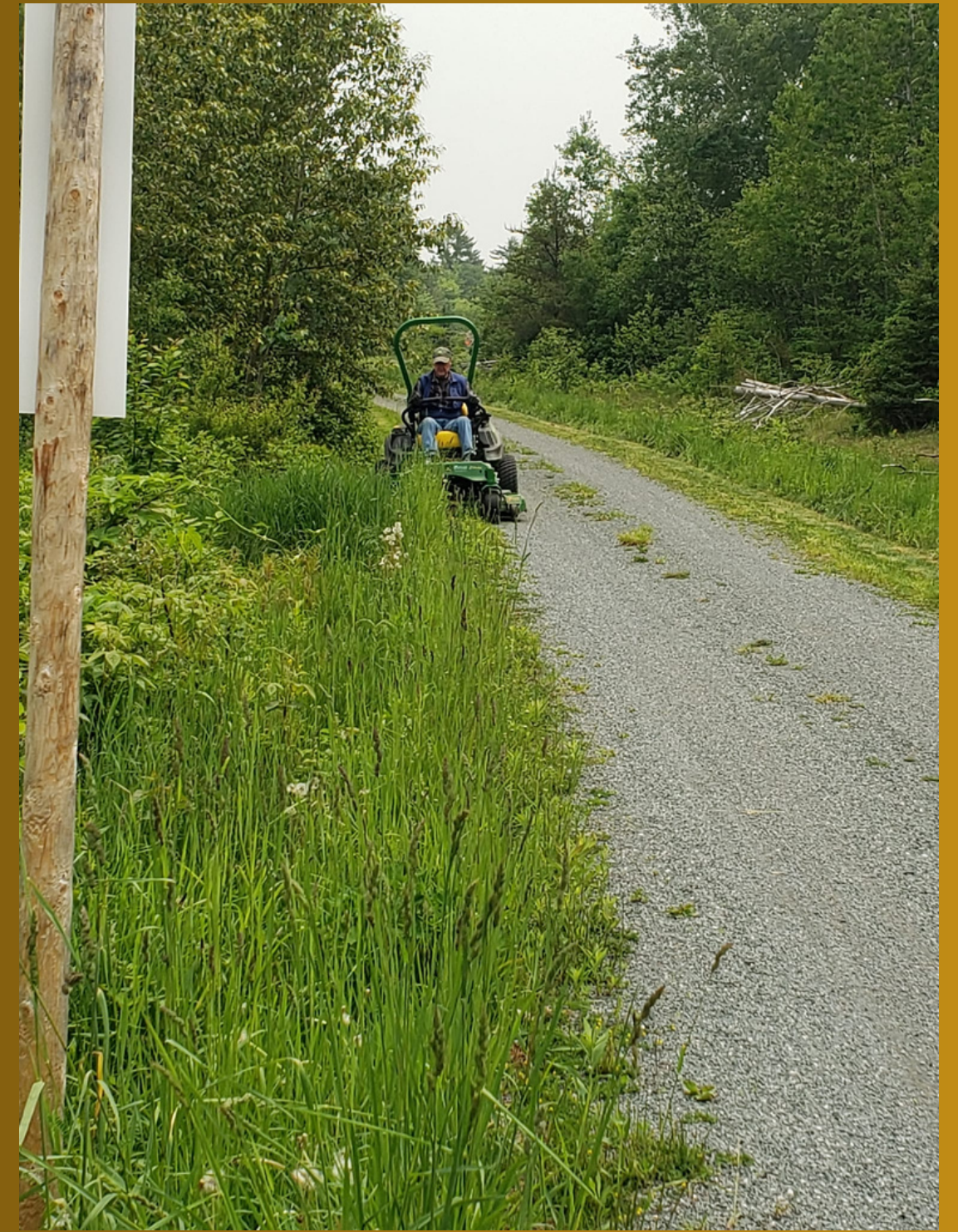
New equipment, more mowing, & brushing