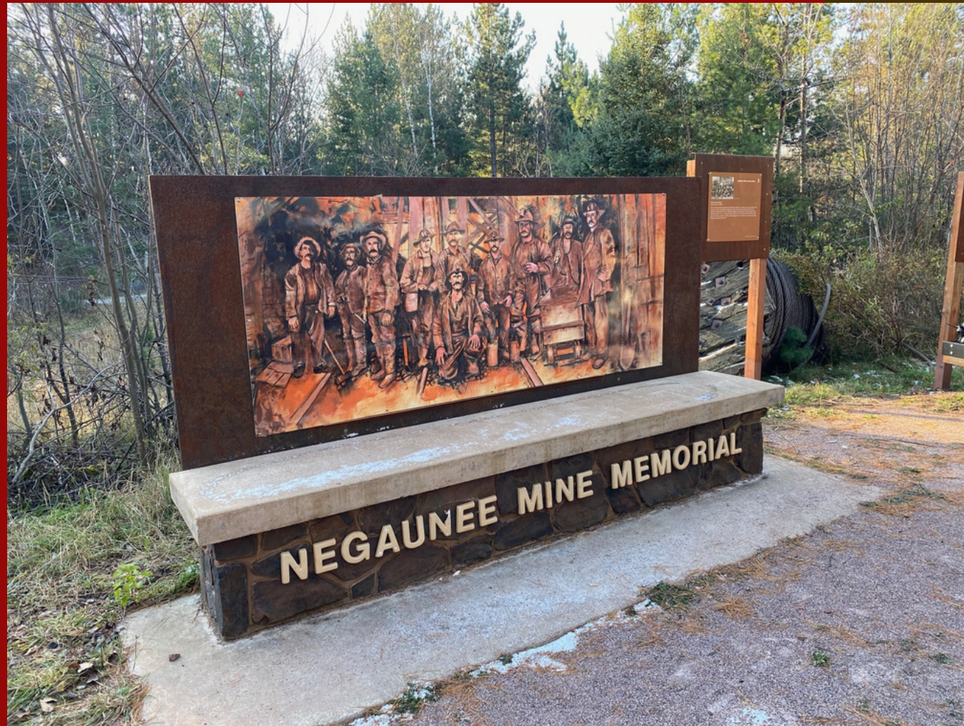
Negaunee Mine Memorial new anti graffiti artwork and rearrangement of signage for easier access