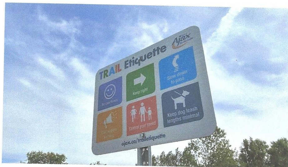
Figure 3 Town of Ajax Trail Etiquette Sign

The Town of Ajax introduced trail etiquette signage along their seven-kilometre Waterfront Trail as part of a pilot project. The goal of the project is to collect public feedback on the content and placement of the signage. Ajax's sign (Shown below in Figure 3), displays six key messages to trail users along with colourful illustrations.