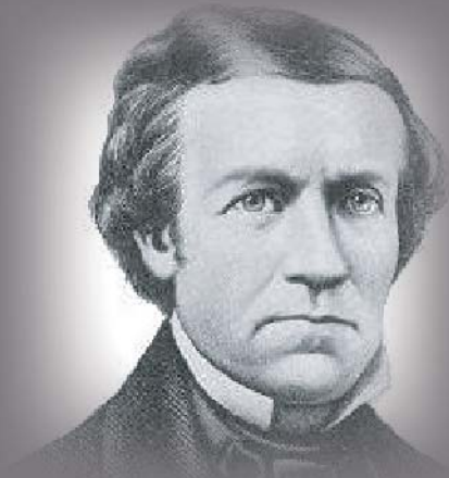
William Austin Burt 1792 - 1858